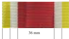
Germany Lippe-Detmold OEK 275, Commemorative Medal for the 1866 Campaign, yellow-white-red-white-yellow, but this ribbon had been at no time 27 mm wide!